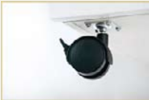
Castors with brake for convenient mobility and firm standing.