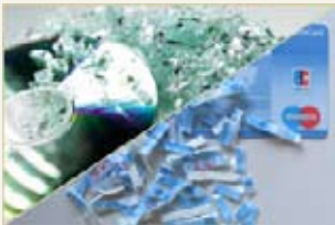
This document shredder destroys CDs/DVDs and cheque cards.