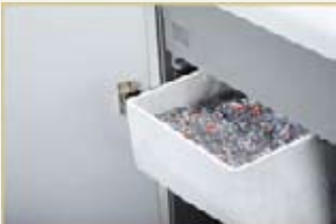
Separate waste box for CDs/DVDs and cheque cards.