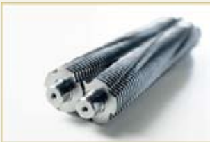
Solid-steel cutters in special steel can cope with paper clips and staples.